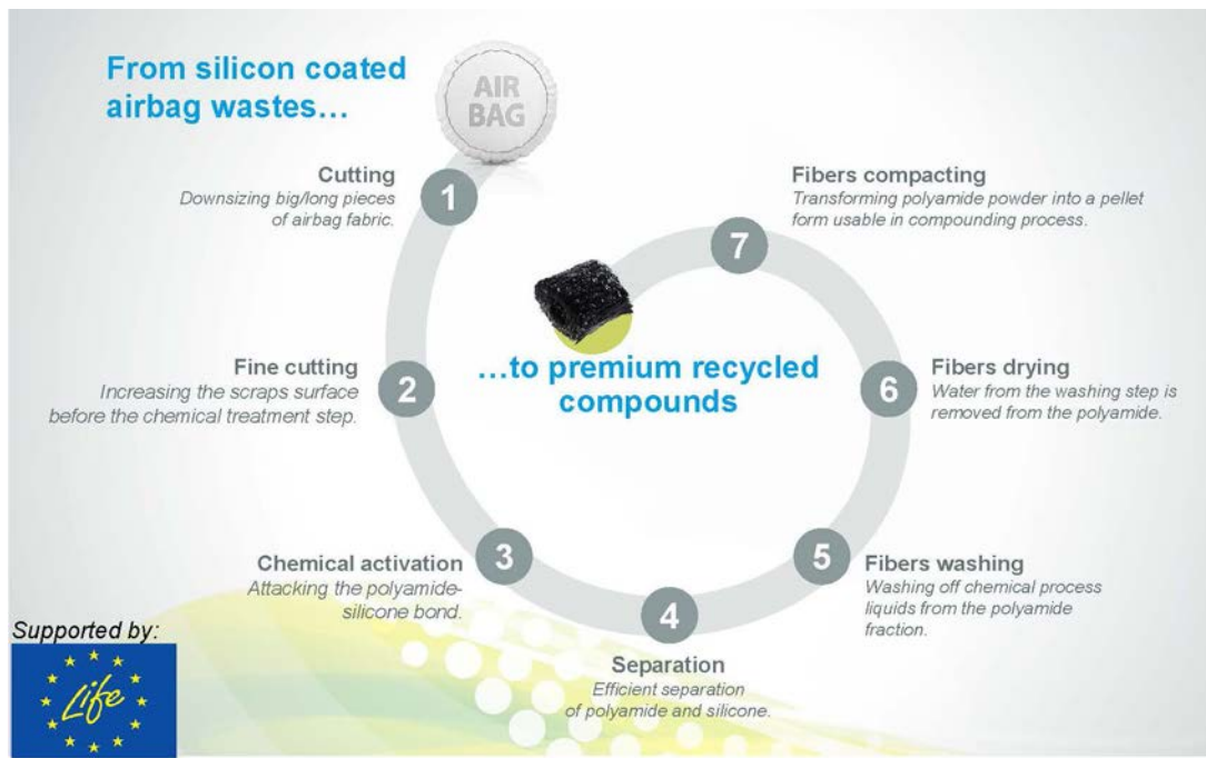
Diagram of the process