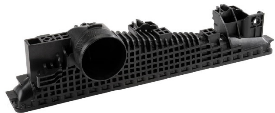
‘Smart molecule’ technology makes Technyl® REDx the ideal solution for highly demanding Charge Air Coolers