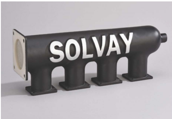
Polimotor 2 plenum, 3D printed using Sinterline® Technyl® powders.

Aaron Wood AH&M Marketing Communications +1 413 448 2260 Ext. 470 awood@ahmnc.com